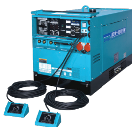
Diesel Welding Machine