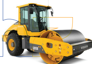
Roller Compactor (Ranging from 1 Ton - 25 Ton)