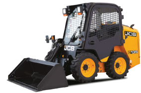
Skid Steer Loader